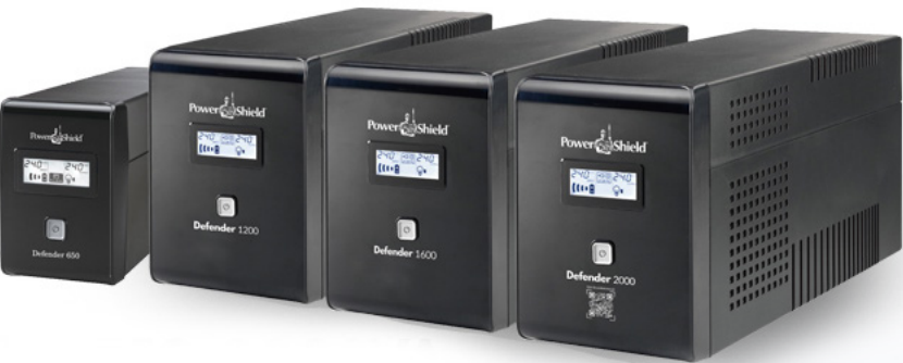
Defender Series Tower UPS 650VA | 1200 | 1600VA | 2000VA

Peace of Mind Protection from PowerShield's Most Popular UPS Range