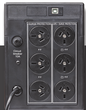
PSD1200, 1600, 2000