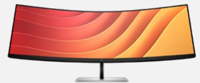
HP E45c G5 DQHD Curved Monitor